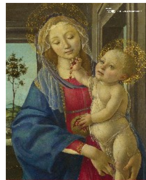
2021 Columban Art Calendar

The 2021 Columban Calendars are now available for purchase at the main entrance for $9 donation each.